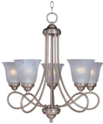
11044MRSN Nova 5-Light Chandelier