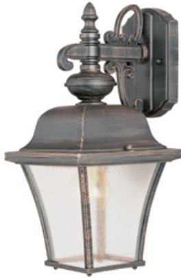
1066RP Senator 1-Light Outdoor Wall Lantern