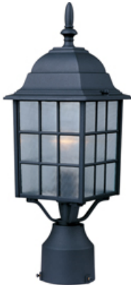
1052BK North Church 1-Light Outdoor Pole/Post Lantern