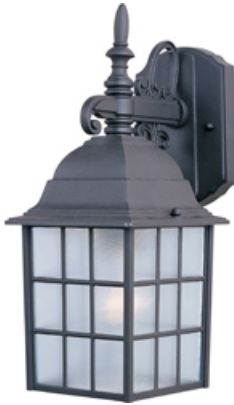
1051BK North Church 1-Light Outdoor Wall Lantern