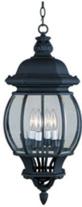
1039BK Crown Hill 4-Light Outdoor Hanging Lantern