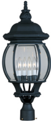
1038RP Crown Hill 4-Light Outdoor Pole/Post Lantern