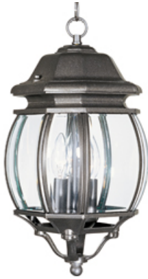
1036RP Crown Hill 3-Light Outdoor Hanging Lantern