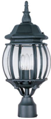
1035BK Crown Hill 3-Light Outdoor Pole/Post Lantern