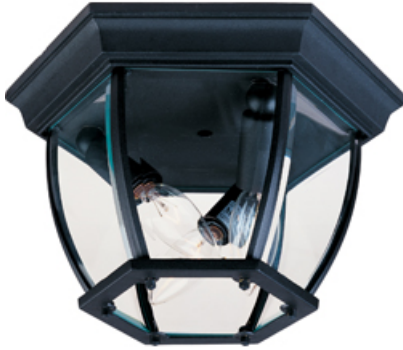
1029BK 3-Light Outdoor Ceiling Mount