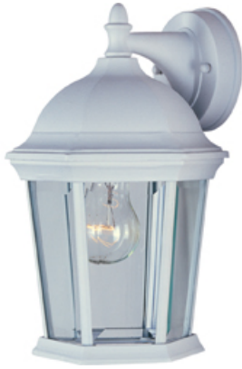
1024WT Builder Cast 1-Light Outdoor Wall Lantern