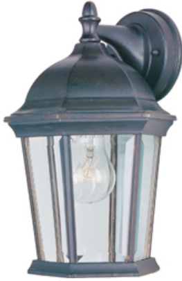
1024EB Builder Cast 1-Light Outdoor Wall Lantern