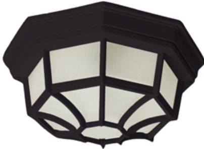
1020BK Crown Hill 2-Light Outdoor Ceiling Mount