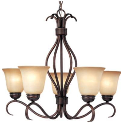
10125WSOI Basix 5-Light Chandelier