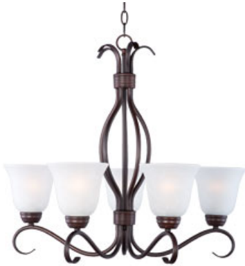
10125ICOI Basix 5-Light Chandelier