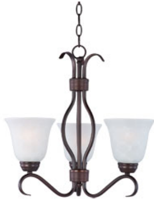
10123ICOI Basix 3-Light Chandelier