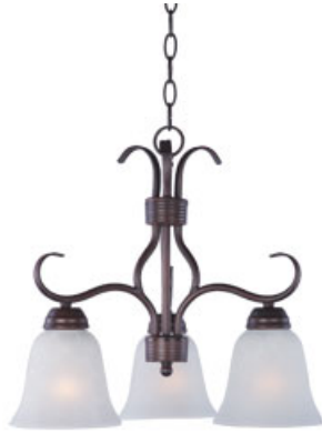
10122ICOI Basix 3-Light Chandelier