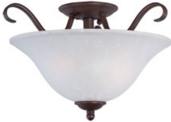
10120ICOI Basix 2-Light Semi-Flush Mount