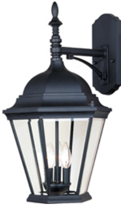
1008BK Westlake Cast 3-Light Outdoor Wall Lantern