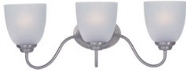
10073FTSN Stefan 3-Light Bath Vanity