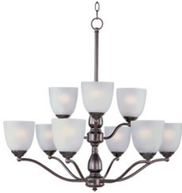
10066FTOI Stefan 9-Light Chandelier