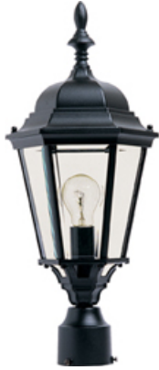
1005BK Westlake Cast 1-Light Outdoor Pole/Post Lantern