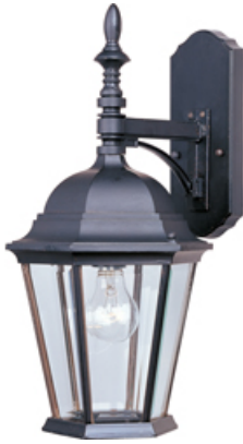
1004EB Westlake Cast 1-Light Outdoor Wall Lantern