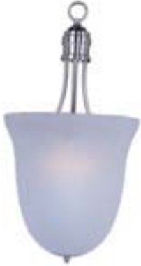
10048FTSN Logan 3-Light Pendant