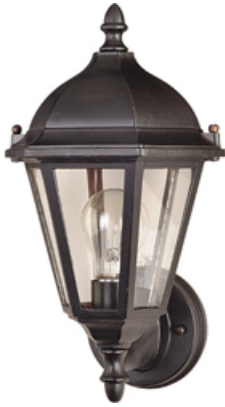
1002EB Westlake Cast 1-Light Outdoor Wall Lantern