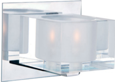
10001CLPC Cubic 1-Light Bath Vanity