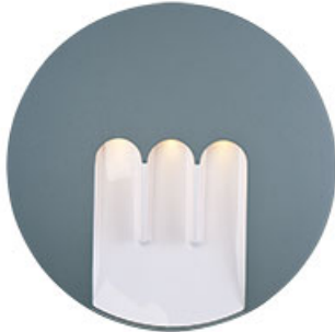
E41424-PL Alumilux DC 3-Light LED Wall Sconce