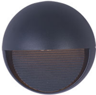
E41413-BZ Alumilux DC 3-Light LED Wall Sconce