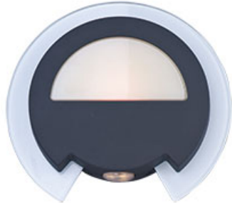
E41409-09BZ Alumilux DC 2-Light LED Wall Sconce