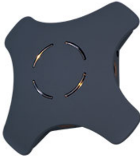
E41407-BZ Alumilux DC 5-Light LED Wall Sconce