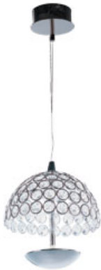
E24491-20PC Parasol 1-Light LED Pendant