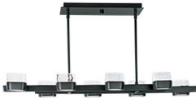
E22897-89BZ Volt 16-Light LED Pendant