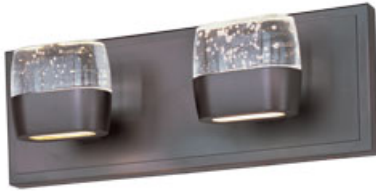
E22892-89BZ Volt 2-Light LED Vanity