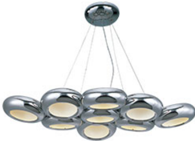
E22599-PC Donuts 9-Light LED Pendant