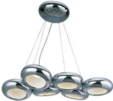
E22596-PC Donuts 6-Light LED Pendant