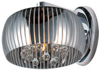
E21409-81PC Sense II 1-Light Wall Sconce