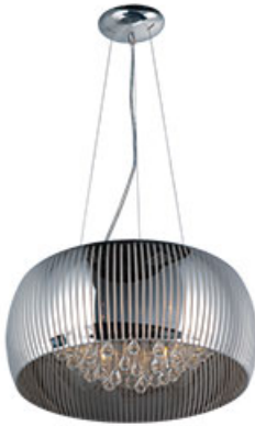
E21406-81PC Sense II 6-Light Pendant