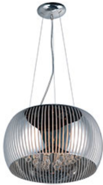
E21405-81PC Sense II 5-Light Pendant