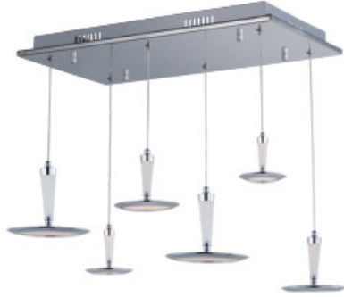
E21166-01PC Hilite 6-Light LED Pendant