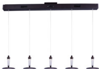
E21165-01BZ Hilite 5-Light LED Pendant