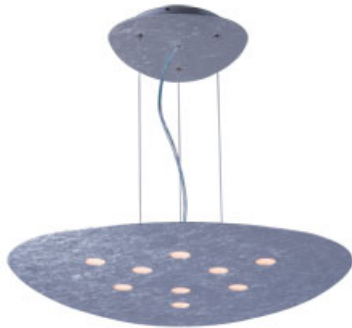
E20785-SF Palette LED Pendant