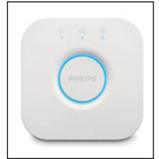
LEMSC19001 Phillip Hue Bridge (NOT included ~ Available for purchase)