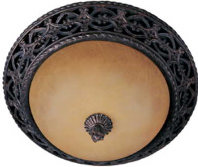
20280VAOI Portofino 3-Light Flush Mount