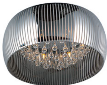
E21403-81PC Sense II 6-Light Flush Mount